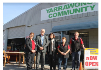
Pictured: Damian Drum MP with MHA Care staff

The MHA Care Opportunity Shop and Foodshare warehouse welcomed a visit by the Federal Member for Murray Mr. Damian Drum MP. The visit provided a wonderful opportunity to showcase the very important Moira Foodshare program and gave Mr. Drum a greater insight of the positive outcomes achieved for those people and communities who are in need. During the visit at the Opportunity Shop he saw first hand the valuable contribution our volunteers provide to ensure much needed funds are provided back into our communities for additional care and service delivery beyond what MHA Care is funded for.